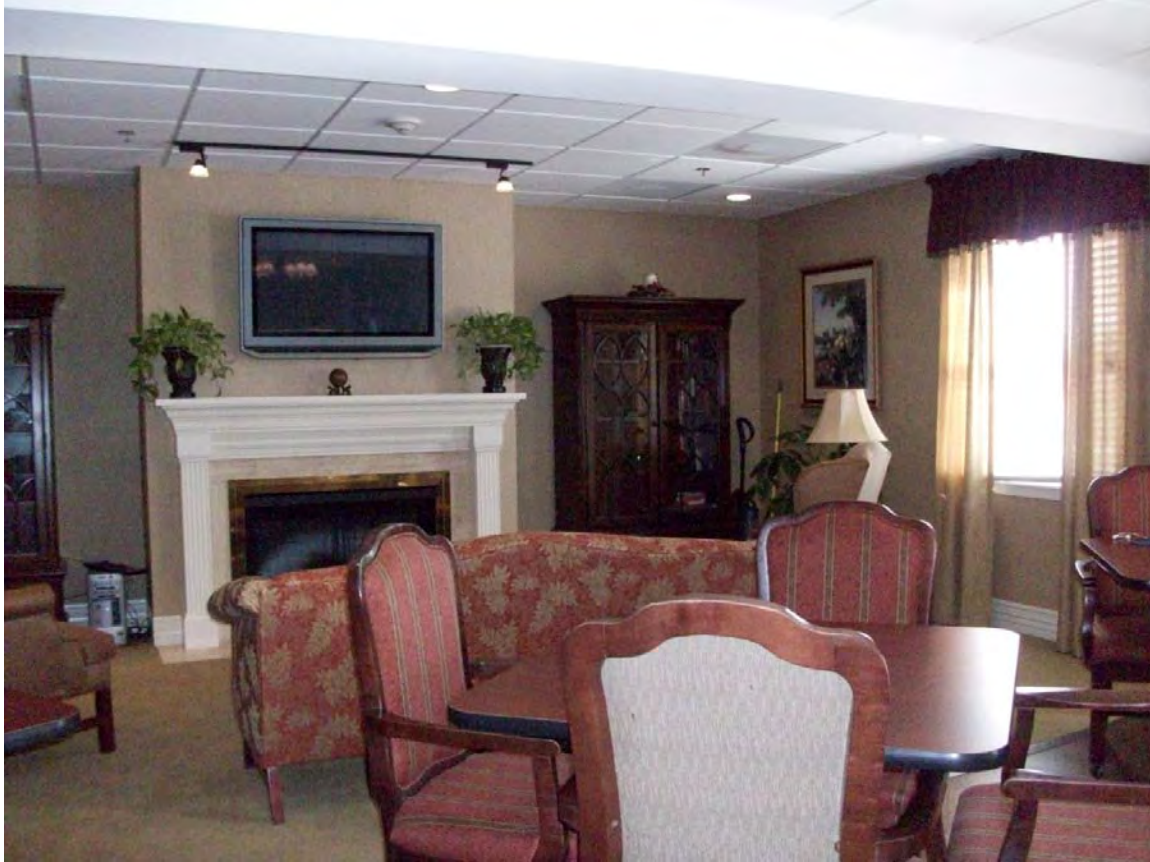
A neighborhood dining room

To maintain a peaceful homey environment, they utilize a silent call system. Overhead paging is only utilized for fire drills and emergencies.