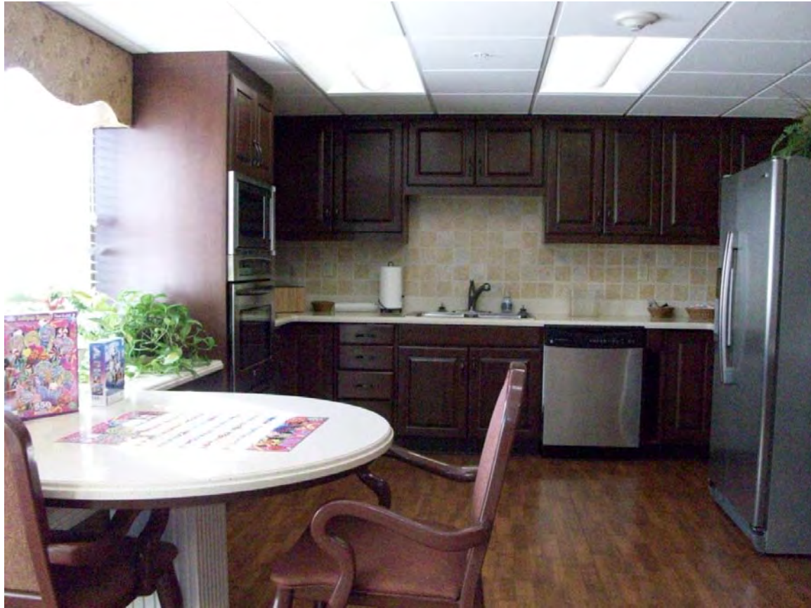
One of several neighborhood kitchenettes