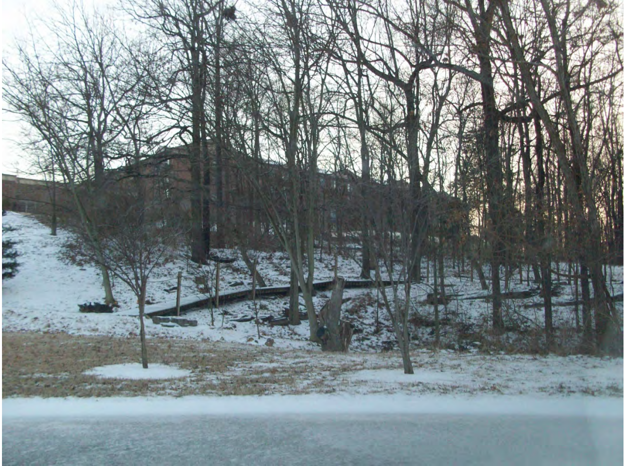
Handicap accessible wildflower trail

A lot of University Students provide volunteer services. They also have a special partnership and frequent interactions with the students from Franklin Elementary School. Not long before my visit, the students had visited and given the residents Valentine's Day cards. It is not a one-way relationship though; residents really enjoy giving to the students by holding a school supply drive for them. Another favorite is when the Teen Challenge Choir comes to perform. Several independent living residents also do volunteer work in the nursing home.