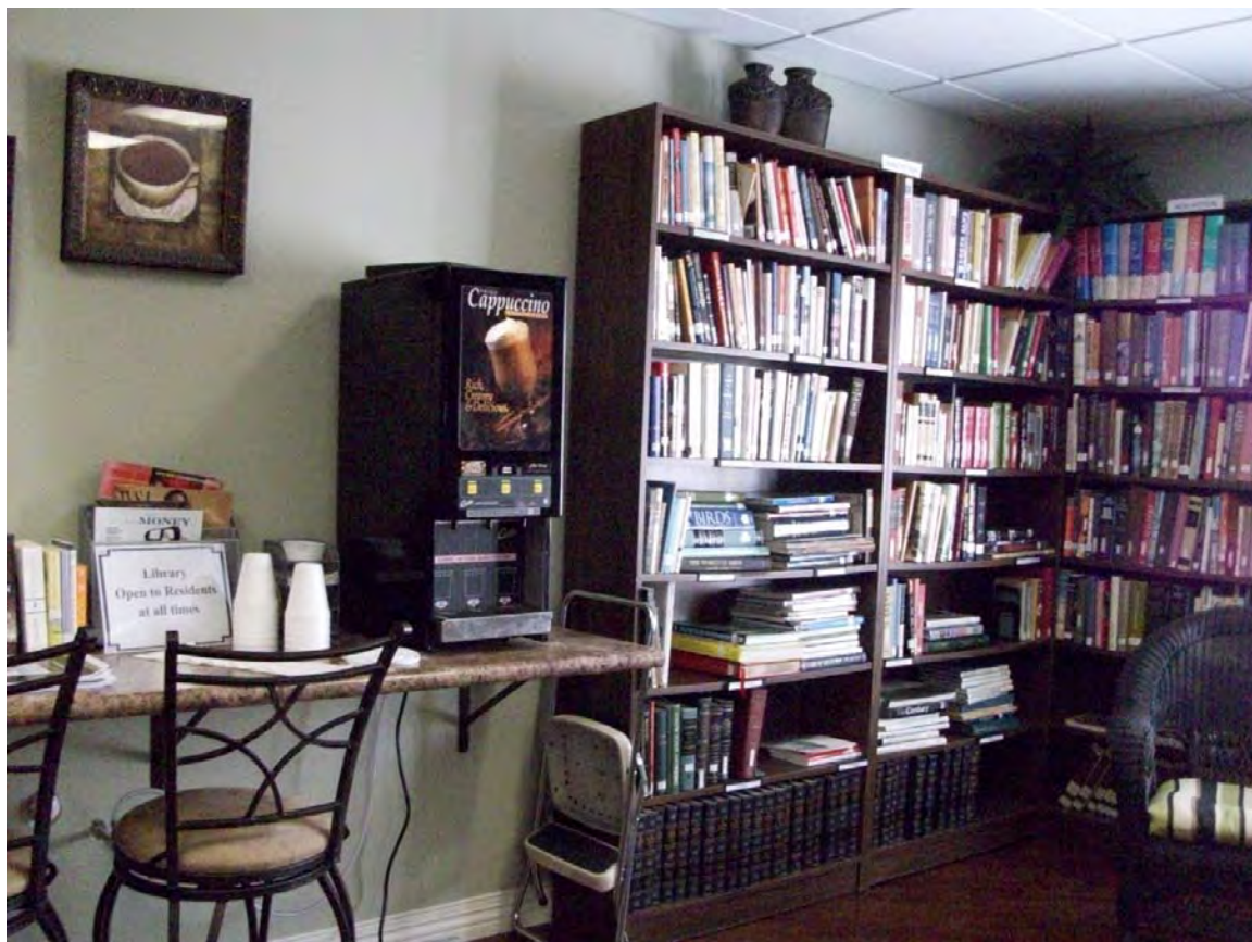
Cappuccino Machine in the Library

We discussed some of the changes she has seen over the past three years. The most significant improvement has been in food service. They now have restaurant style dining with more choices offered. There are two entre choices at meals, plus a long list of menu items that are always available, and a variety of desserts. She especially likes the "theme meals." In October, they had German food during Oktoberfest. The theme around Valentine's Day was "Love in Paris" with French food being served. The residents also enjoy hanging out in the dining room after meals and visiting over coffee.