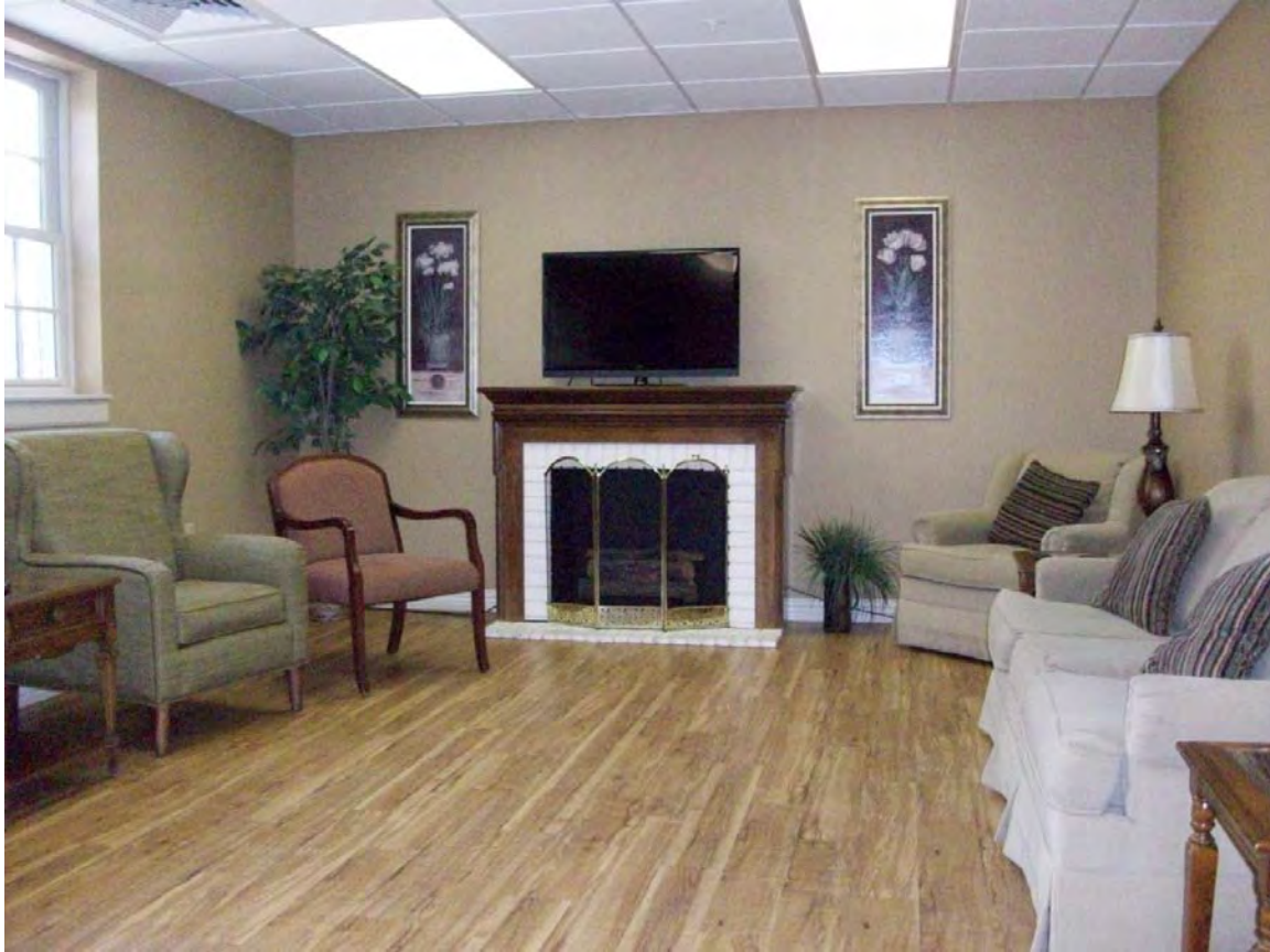
A neighborhood living room