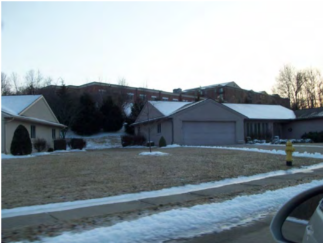
Independent Living Homes