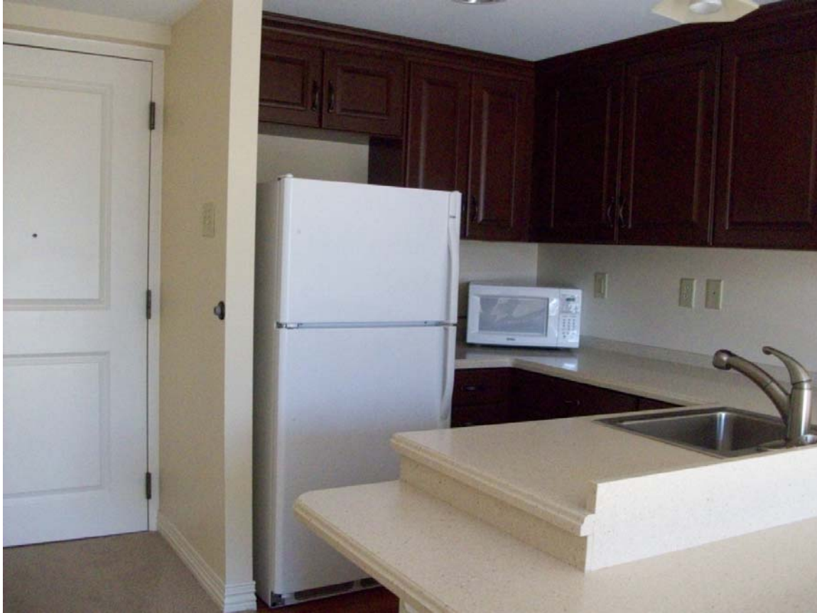
An Assisted Living Apartment

There are many opportunities for residents to stay active. In addition to the busy organized activity schedule, the activity room is always open. There is a wheelchair accessible wildflower trail through the woods on the property. Many residents enjoy participating in maintaining the gardens, including several who are master gardeners. Others enjoy working on projects in the woodworking shop.