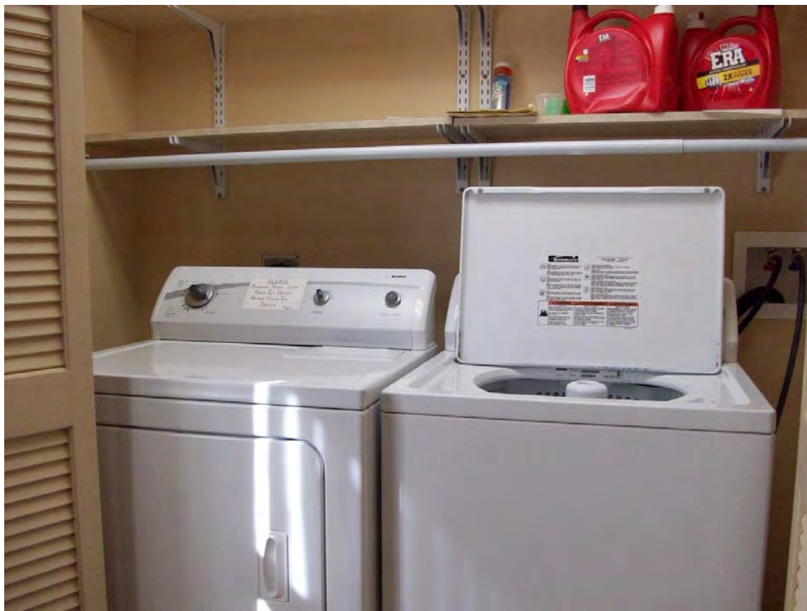
One of several household laundries available to residents and their families

Something that I found to be most impressive is that there are seven guest apartments available for visitors. Visitors of residents who are dying stay for free. Two nights are free for guests from out-of-town. There is a small fee for additional nights, but it is still less expensive and more convenient than a hotel.