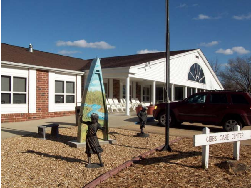
Gibbs Care Center

In January 2012, I visited Gibbs Care Center. Gibbs is a 72-resident, not-for-profit, community owned, Medicare/Medicaid certified, skilled nursing home located in Steelville. The home originally opened in 1977, but has been renovated and expanded over the years, including the addition of a 26-resident residential care home, Gibbs Manor.