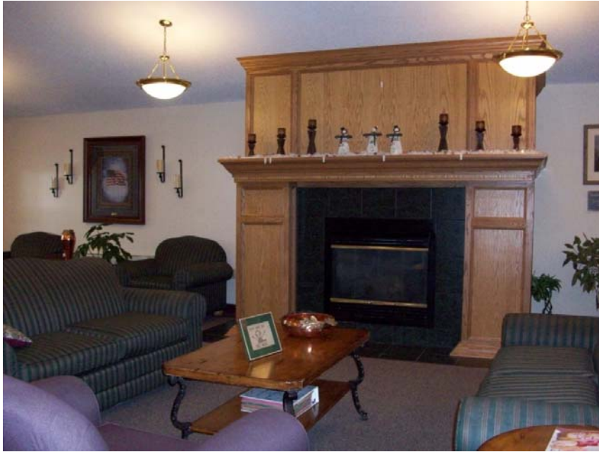
Old dining room that has been converted into a living room