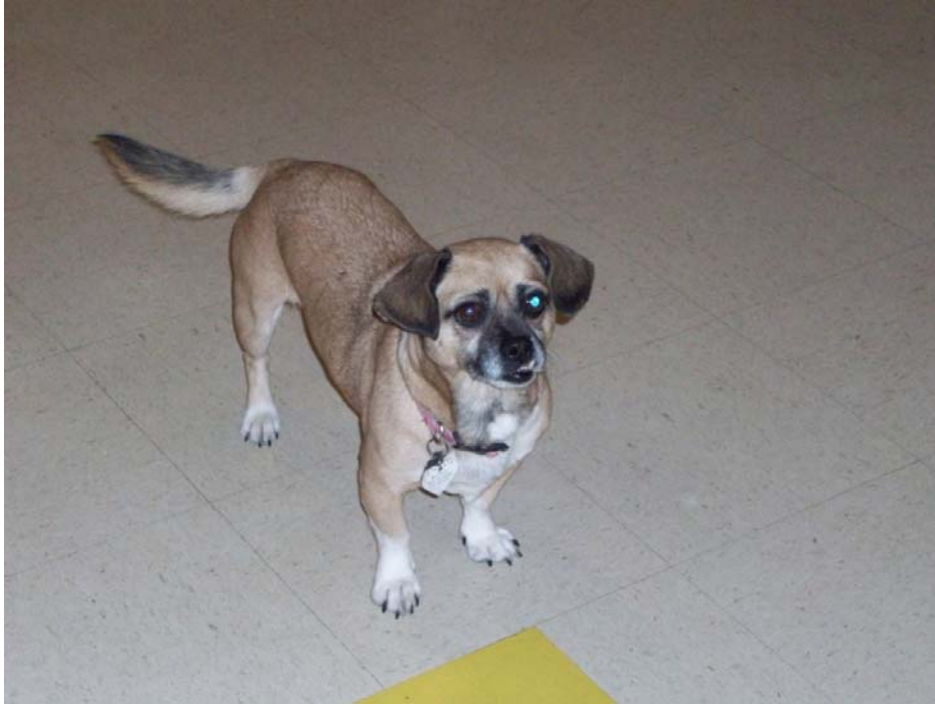
Mutley – Comes to work every day with the Assistant Director of Nursing

When residents pass away, they have a memory book with pictures. It is passed around and people write whatever they want. Then it is given to the resident's family.