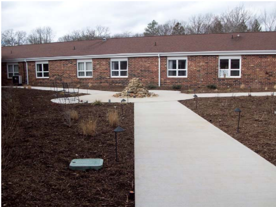
New fountain in the courtyard