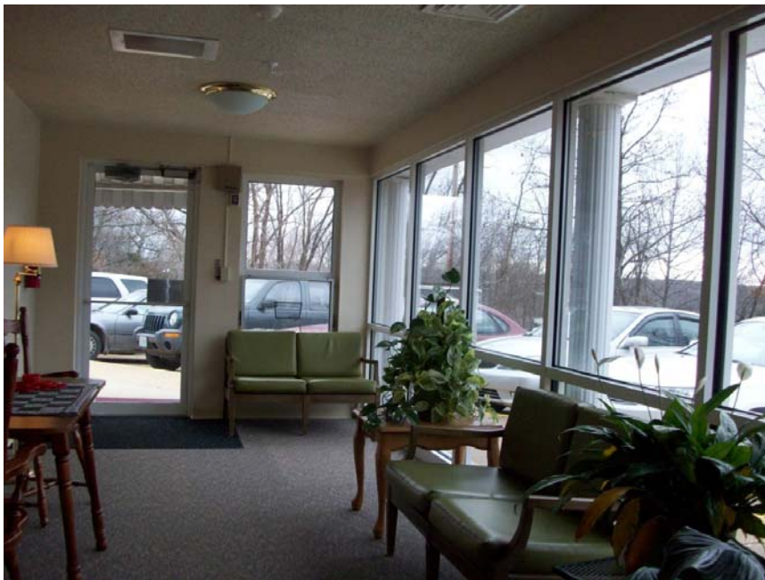
One of the sunrooms that was added about ten years ago