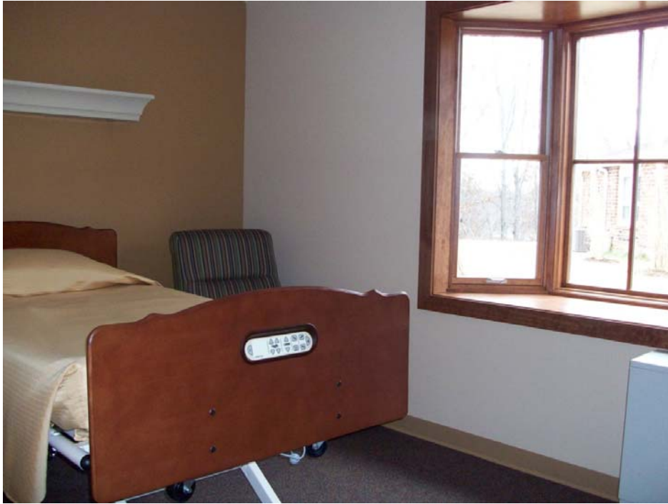
New private room with bay window

They added a lot of glass to allow the sunlight in. They also added a lot of carpet. There is also a new beauty shop. They removed the old institutional nurses' station and replaced it with a small desk. The audible call system has been replaced with a silent wireless pager system. They also removed the lights above the doors. They added new covered and uncovered patios. They added a new water fountain in the courtyard and will be adding benches and picnic tables. They are thinking about adding a swing set for children. They will also be adding bird and wildlife feeders in back of the building.