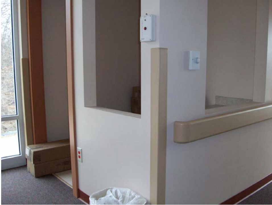
New nurses' work area

The Steelville Arts Council is going to help decorate the home with artwork that is relevant to the community. There is already a decorated canoe out front. Similar canoes can be found throughout Steelville. Artists will display their artwork and will rotate it in and out. There will be "Then and now" photos of the downtown area and a mule display. There will also be a display made from the many thank you cards that they receive from residents' family members.