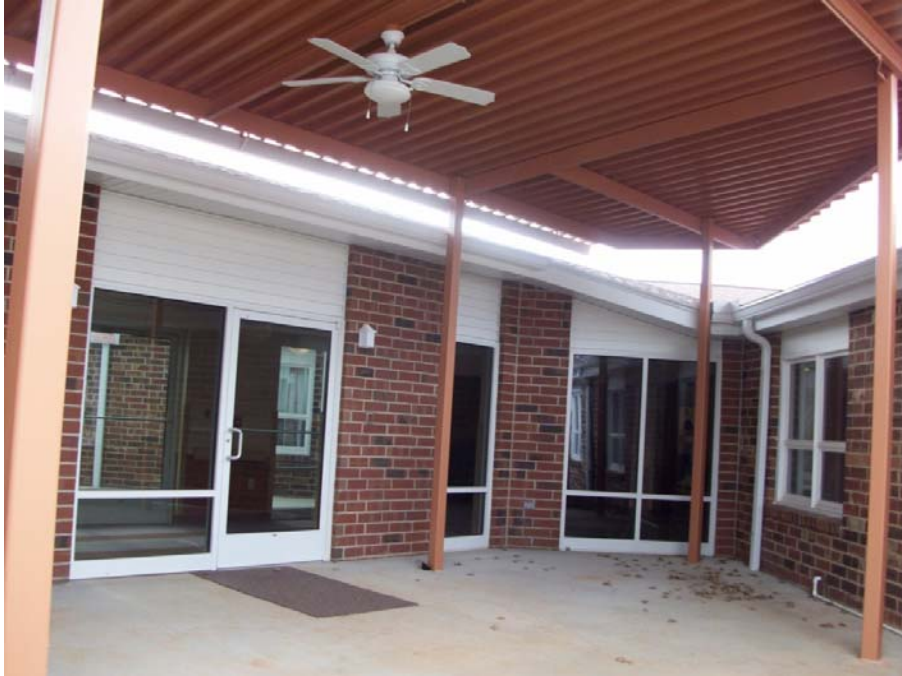
New covered patio