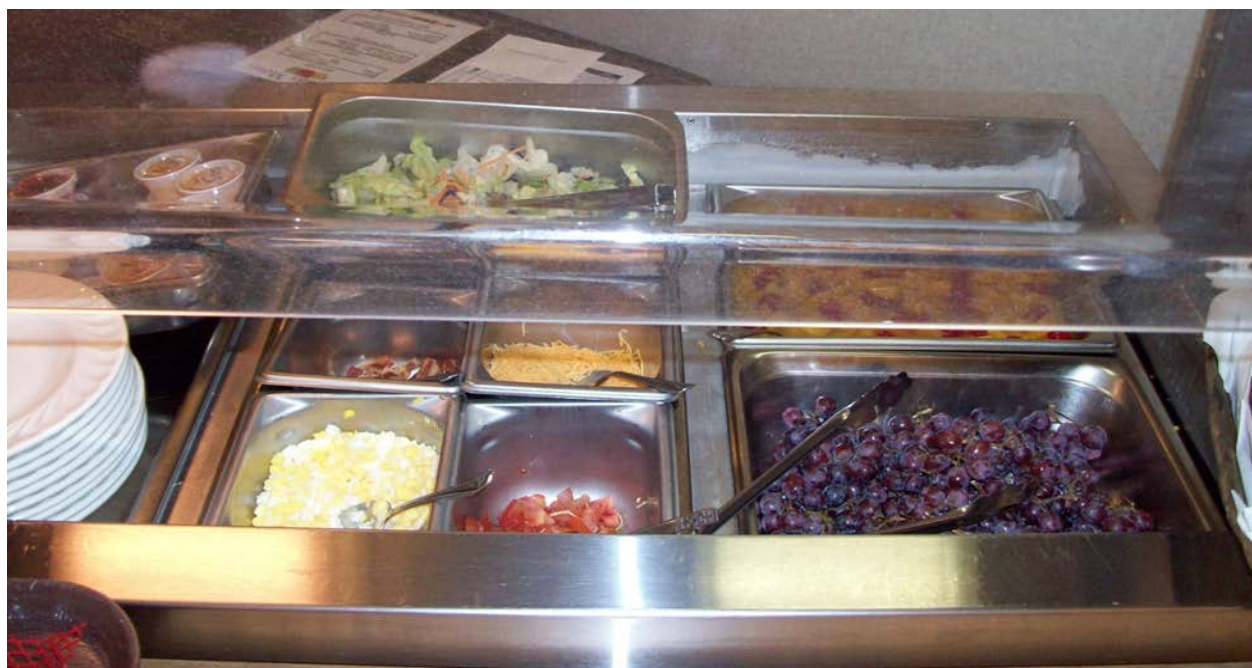
Salad and fruit bar