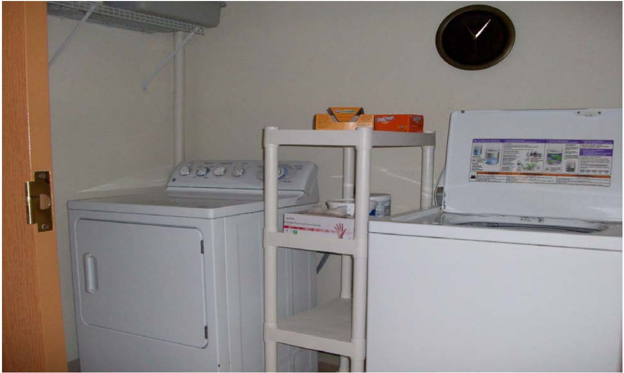
Assisted living laundry available to residents and their family members