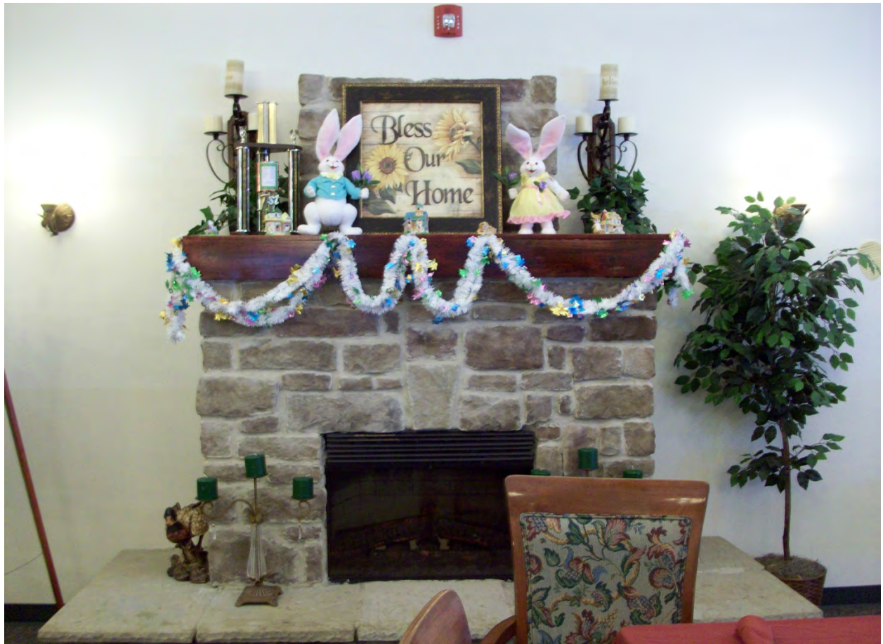
Fireplace in the dining room