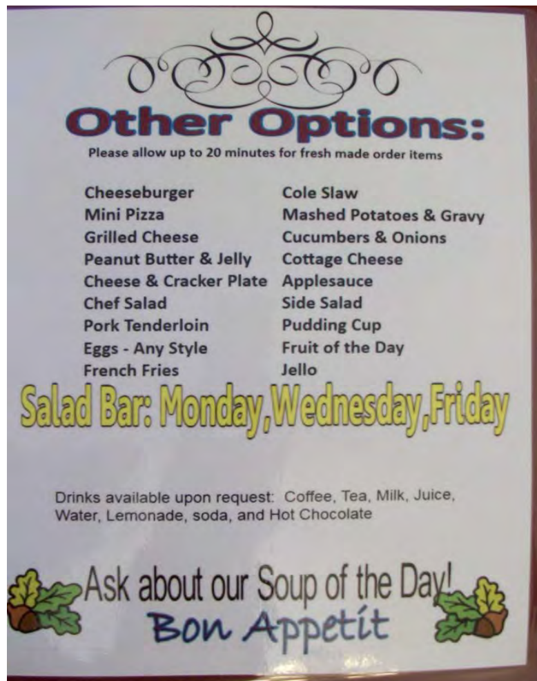
Always available menu