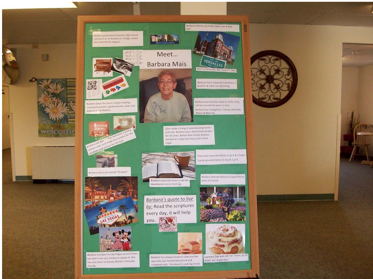
Focus on a Resident board