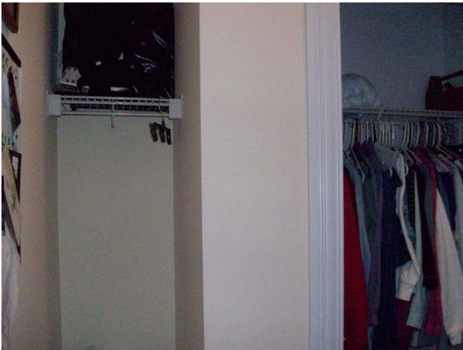
Each resident room is equipped with a closed and an open closet.

Resident rooms are designed with subtle features that provide residents with dementia the dignity of independence that they likely would lose sooner otherwise. Each room has a closet with a door as well as an open closet. Each evening, caregivers assist residents to choose their clothes for the next day. The