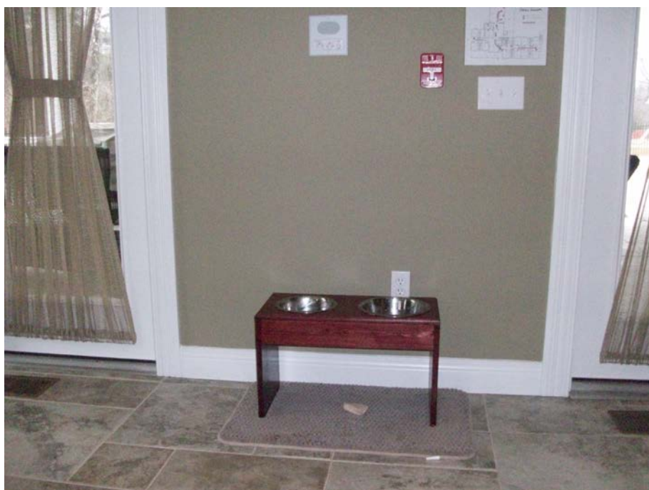
Clermont Manor's dog's food and water bowls. He was in his crate during mealtime.

Some homes have pets and others don't, based on the preferences of the residents who live there. I was told that one of the homes has a couple cats. During my visit to Clermont Manor, I noticed a set of food and water bowls but I didn't see the dog. It was mealtime and he was in his crate.