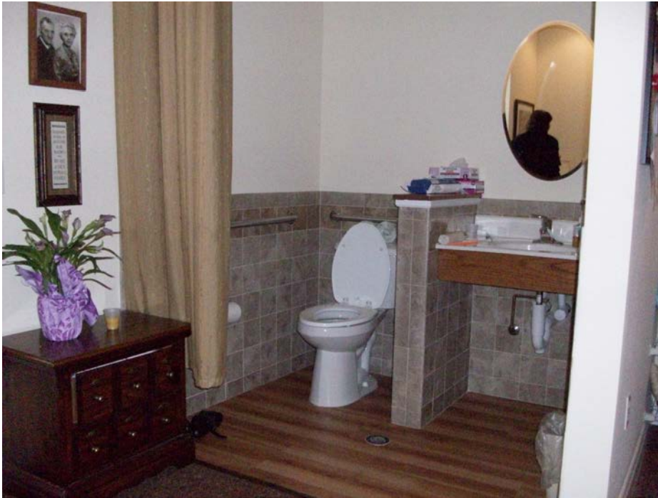
Three-walled restrooms make access easy, while still providing needed privacy.

clothes are then hung in the open closet so that they are in plain view and the closet with the door is closed. Seeing the clothes hanging in the open closet cues the resident to put the clothes on without having to ask for assistance.