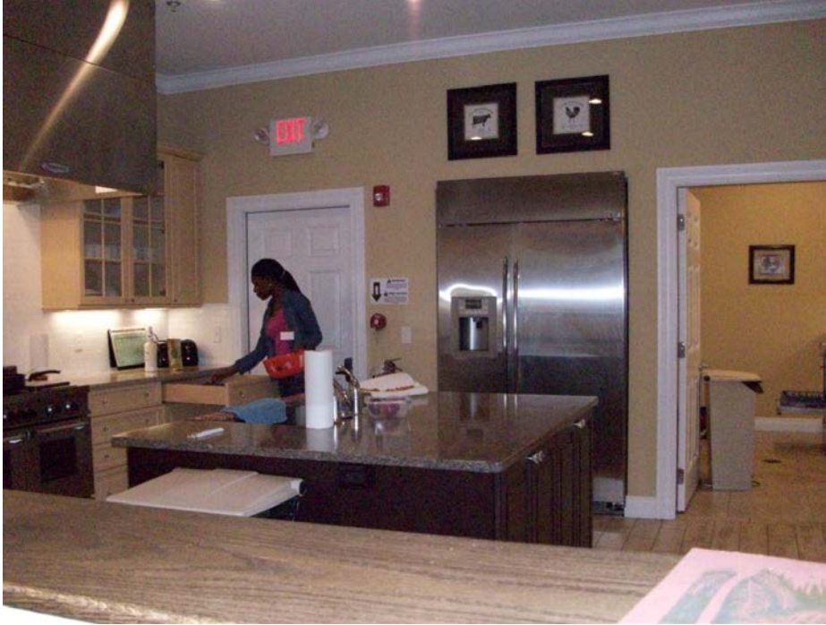
Clermont Manor's open kitchen.

Menus are prepared by a dietician, but all staff members are trained in food preparation and have the flexibility to prepare whatever residents want. Staff members eat with the residents, which helps to remind some residents to eat. The central kitchen and dining room are open at all times. Residents and visitors can help themselves and meals are free for visitors. There are safety mechanisms in place to protect residents who need assistance with the appliances. The open kitchen and family style dining setting stimulates appetites and encourages residents to eat well. Weight loss is not a problem they have to deal with. Some residents also enjoy helping in the kitchen.