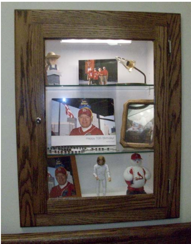
Each resident room has a case outside the door for displaying personal memorabilia.

Each home has ten private rooms; an open kitchen and dining room; an enclosed courtyard with a covered patio and walking path; and a family room and sun room, each with a fireplace and large flat-screen television. All rooms have cable television; however, most residents prefer to watch TV with the other residents in the common areas. The buildings are designed so that all rooms have a view of the yard. Residents can go outdoors anytime. There is a camera and chime that lets the caregivers know that someone has gone outside. The porches are used a lot and barbecuing is very popular.