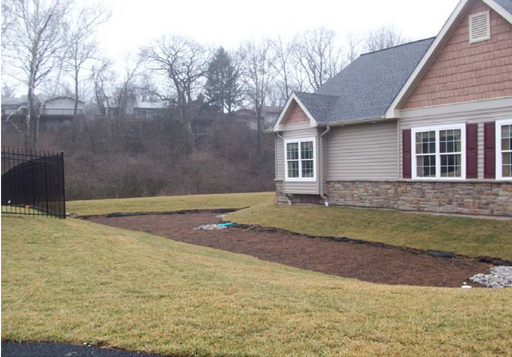
Site of Lourdes Manor's future rain garden, which will be filled with Missouri native plants.