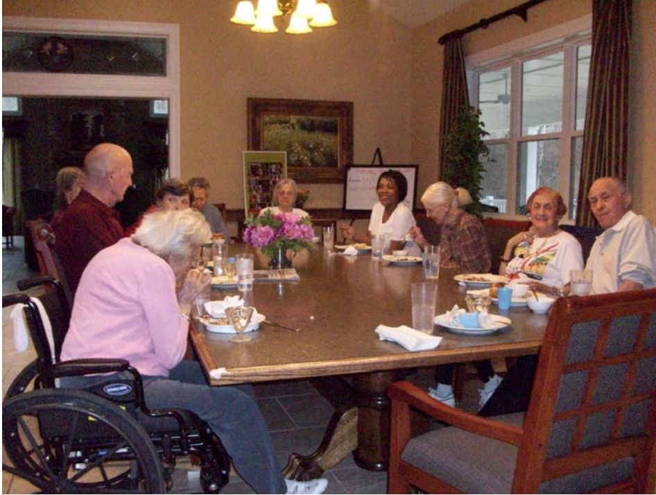
Residents, staff, and family members enjoying lunch at Clermont Manor.