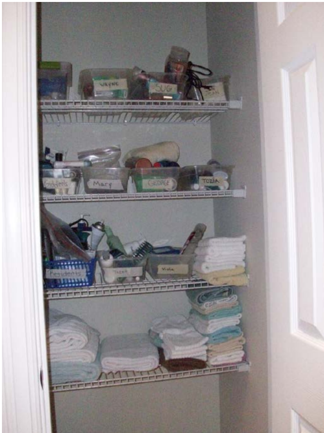
Each resident's personal hygiene items are stored in the bathing room closet for convenience.