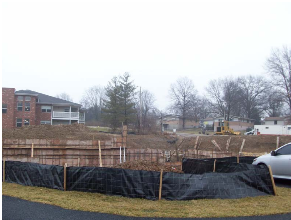
Beginning of construction for Lyon Manor.