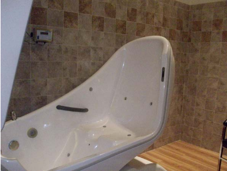
Bath tubs have electronic controls that allow the tub to be tilted for ease of entering and exiting and comfort during bathing.