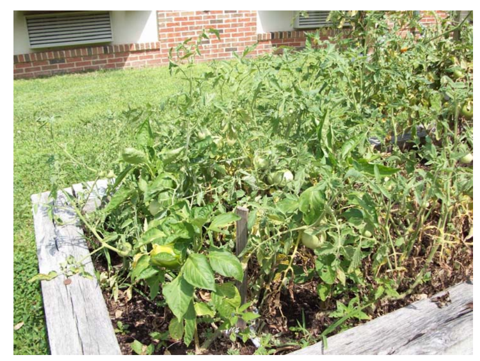
Tomato and pepper plants in raised garden

Something else she likes about life at Gasconade Manor is the fact that she can still do her own laundry. She enjoys doing her own laundry and wants to as long as she is able. Once a week, she takes her laundry to the therapy room. She takes along something to read and also visits with others while she is waiting. Soap and fabric softener is provided for her. When she is done and gets back to her room, staff members help her put her laundry away.