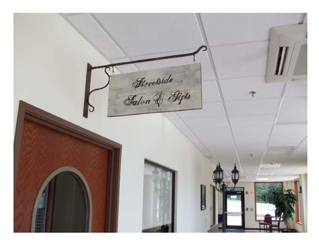
Streetside Salon and Gifts

They have an in-house Therapist. They offer aqua-therapy in their therapy pool that has 92° water, a lift chair, and current. They also have a workout room that staff can use.