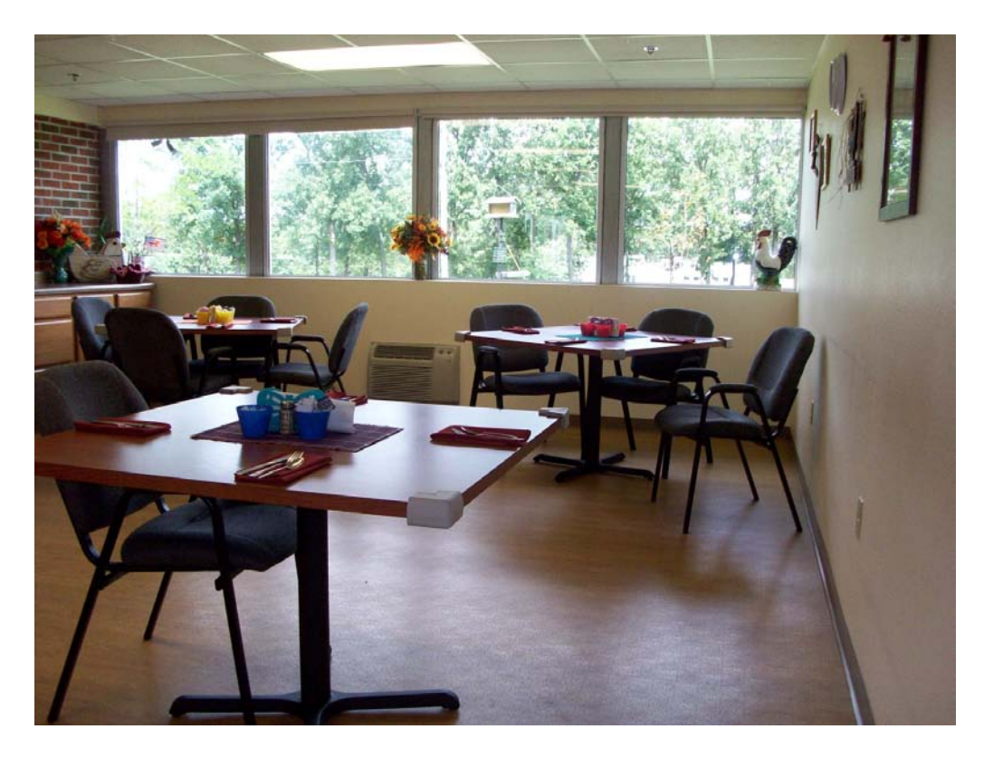
Neighborhood Dining Room

They hold group meetings to review meal choices. Menus are updated based on residents' likes and dislikes. Meals are delivered on steam tables and served in each household. Each meal includes several choices. Servers take orders and deliver the meals to the residents. There are also kitchens available for use by residents and their families. Snacks are available at all times at no extra cost. The snack cart is taken around three times between meals.