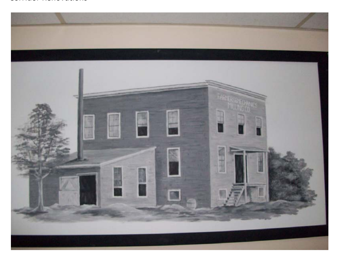
One of many historical murals painted in corridor