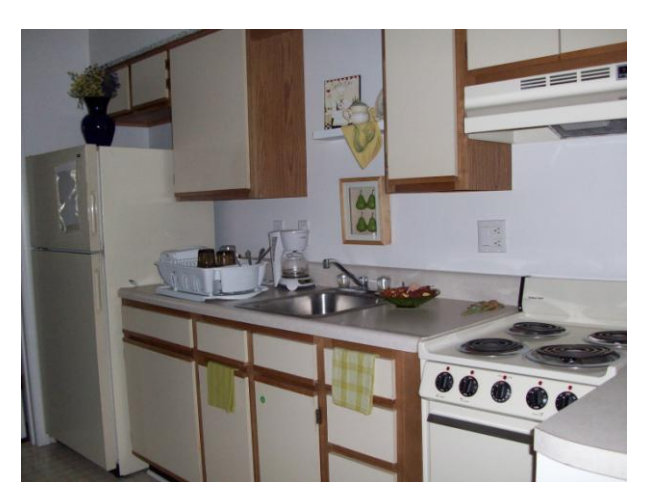
Residential Care Apartment – The Rehabilitation Center of Raymore

During my visit at Raymore, I noticed a sweet smell wafting throughout the building. It turns out that they have an ice cream parlor where they were serving freshly baked cookies. Apparently, I was not the only one who smelled the cookies; it seemed that everyone was there enjoying them. There is a living area across from the ice cream parlor that was completely full, including a large dog lying on the floor.