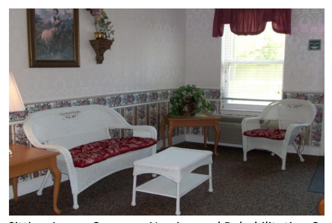
Sitting Area – Cameron Nursing and Rehabilitation Center