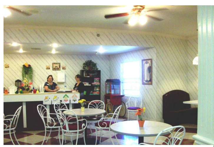
Ice cream parlor – The Rehabilitation Center of Raymore