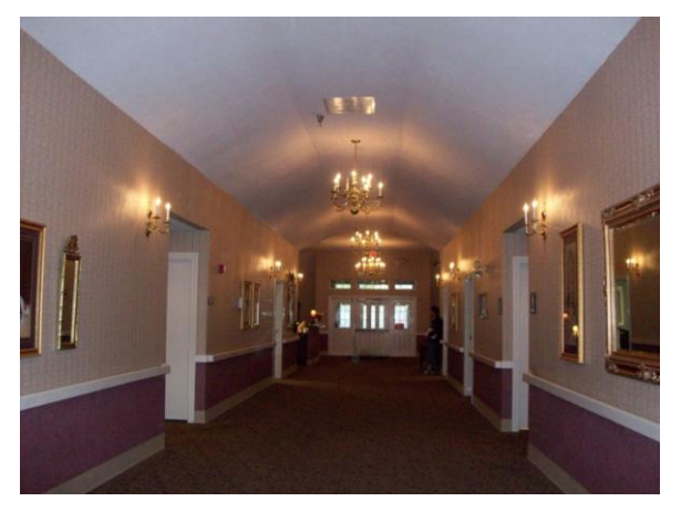
Corridor – The Rehabilitation Center of Independence

The Rehabilitation Center of Independence is making changes. Their current dining experience includes an entrée of the day and an alternate, as well as a "quick menu" with always available items. They are moving to anytime dining, including bedside menus so residents can order anytime they wish, which has already been implemented in their Express Recovery Unit. The residents are renaming the hall names to street names and they plan to add a pool table in the future.