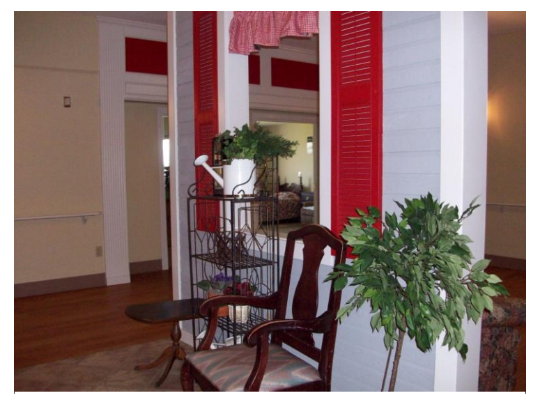
Alzheimer's Unit – The Rehabilitation Center of Raymore

During my visit at Raymore, I noticed a sweet smell wafting throughout the building. It turns out that they have an ice cream parlor where they were serving freshly baked cookies. Apparently, I was not the only one who smelled the cookies; it seemed that everyone was there enjoying them. There is a living area across from the ice cream parlor that was completely full, including a large dog lying on the floor.