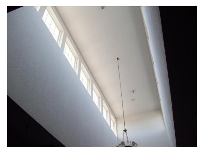
Skylights – Blue River Rehabilitation Center

Holmesdale is located in inner Kansas City. Sachel Page Stadium is nearby and the home is decorated with Negro League baseball memorabilia, as well as Jazz artwork donated by BB's Barbecue. Food is a very important part of the culture at Holmesdale. All their food is cooked from scratch, and they have many food related activities. They have two entrée choices at every meal, as well as an always available menu. They have a kitchenette with snacks, salads, sandwiches, fruit, and yogurt that is available to the residents at all times. They also put in a raised garden last year. Weight loss is not a problem.