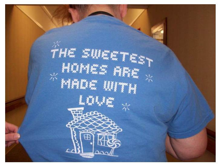
Caregiver – Liberty Terrace Care Center

Liberty Terrace goes the extra mile to ensure they have the right staff. Each employee takes a compatibility survey before being hired. As I walked through the home, I also noticed that staff members were wearing t-shirts with special messages about the care they provide.