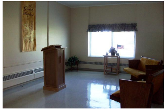
Chapel – Cameron Nursing and Rehabilitation Center