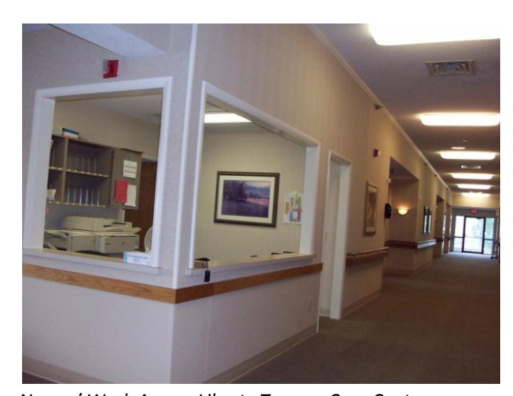
Nurses' Work Area – Liberty Terrace Care Center

They are getting ready to remodel and will be removing their large nursing station. They will also be putting in wood flooring and removing the half-moon "feeder tables." They have already removed the large nursing station from their Express Recovery Unit. Each room in the Express Recovery Unit has telephones, plasma TV's, and wireless internet service.