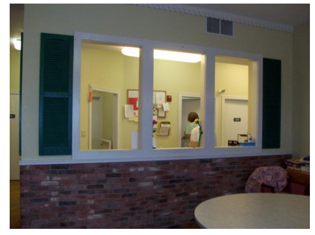
Nurses' Work Area – The Rehabilitation Center of Raymore