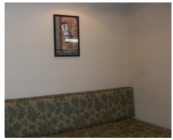
Holmesdale Healthcare and Rehabilitation Center

Pets are also welcome. They recently had a resident whose cat lived with her. They have many plans for the future, including remodeling their bathing rooms; adding a salad bar in the dining room; adding a greenhouse; and adding a lounge with a refrigerator, telephone, and gaming system.