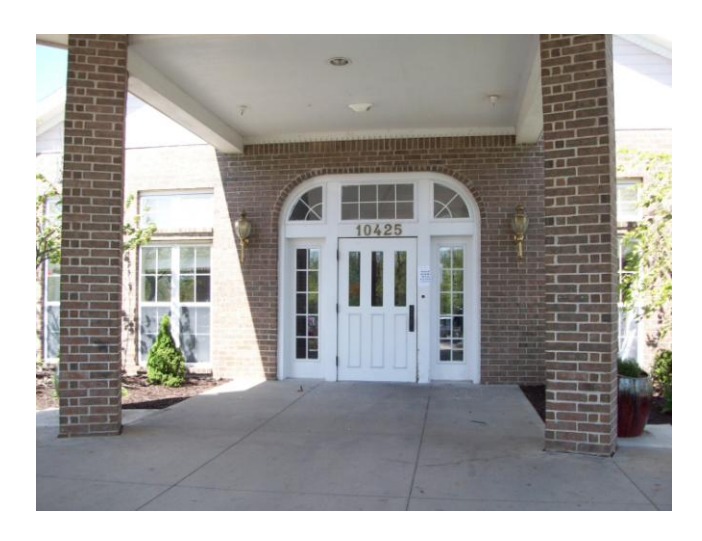
Blue River Rehabilitation Center

I recently toured seven homes located in western Missouri that are operated by Skilled Healthcare: