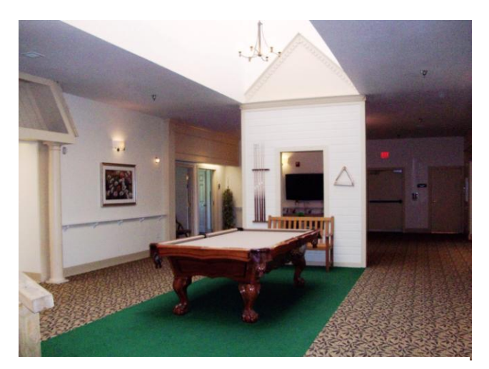
Express Recovery Unit – Blue River Rehabilitation Center

While I was visiting Blue River, residents and staff members were enjoying a concert in the large open area of the building they call the "garden area." They have consistent staffing assignments and open dining. Their dining menus include two entrée choices and "always available" items for each meal. Their Food Committee reevaluates and revises their menus on an ongoing basis. They are planning to add a dessert cart soon. They also have an Alzheimer's unit with all private rooms.