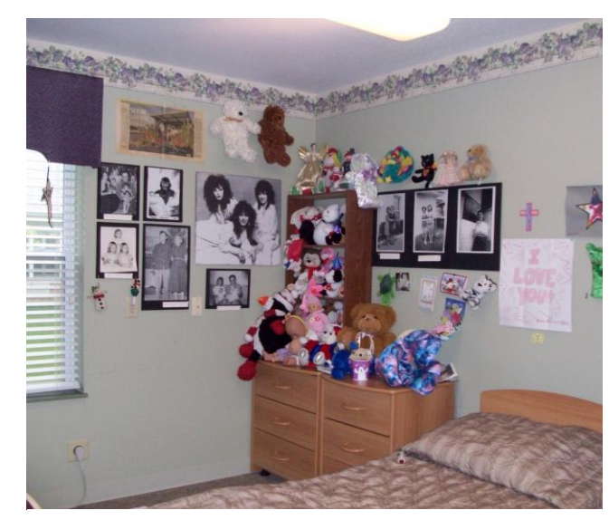
Resident Room - Carmel Hills Healthcare and Rehabilitation Center

Raymore's halls are lined with coves that are decorated by the residents who live nearby. Their Alzheimer's Unit is built so that the room entrances have an exterior finish, giving the feeling of being in a neighborhood. Rather than a big institutional nursing station, there is a small work area with a brick front and shuttered windows.