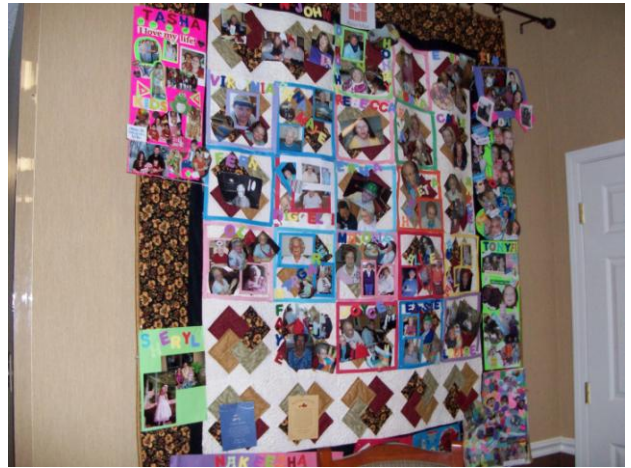
Resident and Staff Quilt

Residents can furnish and decorate their rooms as they wish. Each room is equipped with bathrooms with walk in showers. There is also a central bathing room for residents who need assistance. Many residents have their own refrigerators in their rooms but there is also a community refrigerator as well. They can even have their own pets if they wish.