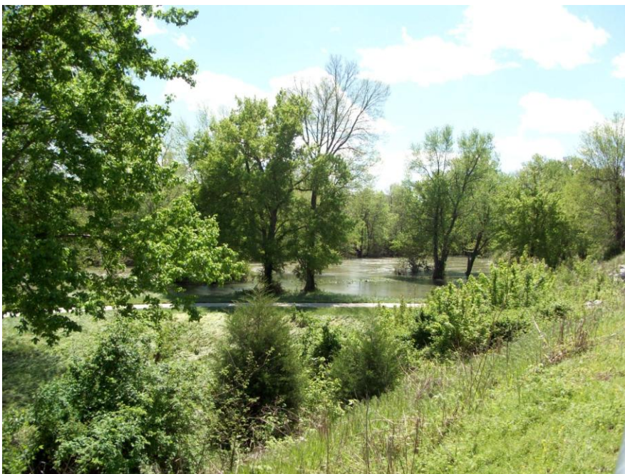
As you can see from this photo taken from the back deck, Riverview Manor lives up to its' name.