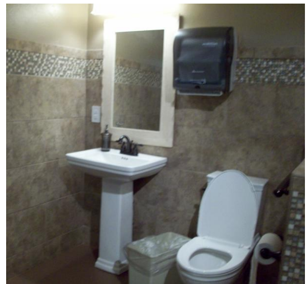
Renovated Bathing Room

In addition to the changes they have already made, their future plans include making administrative workstations (front desk, nurse's stations) look less institutional.