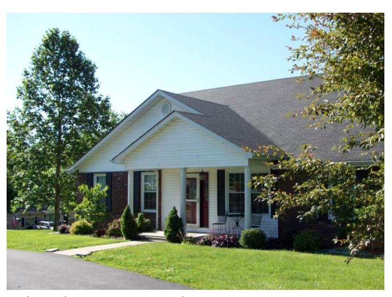
Independent Living Home Adjacent to Harvester RCF

He retired from Boeing, where he worked in Marine Helicopter Promotions. He showed me a photograph that was taken when he was a guest on the Ed Sullivan show. A Vietnam War hero, who had flown a Boeing troop carrier helicopter through fierce firefights to rescue troops, he was being honored on the show. He was invited to appear as a representative from Boeing. He enjoys participating in the men's group. They go on outings and to ballgames. He likes spending time outdoors and there is a long list of activities to participate in.