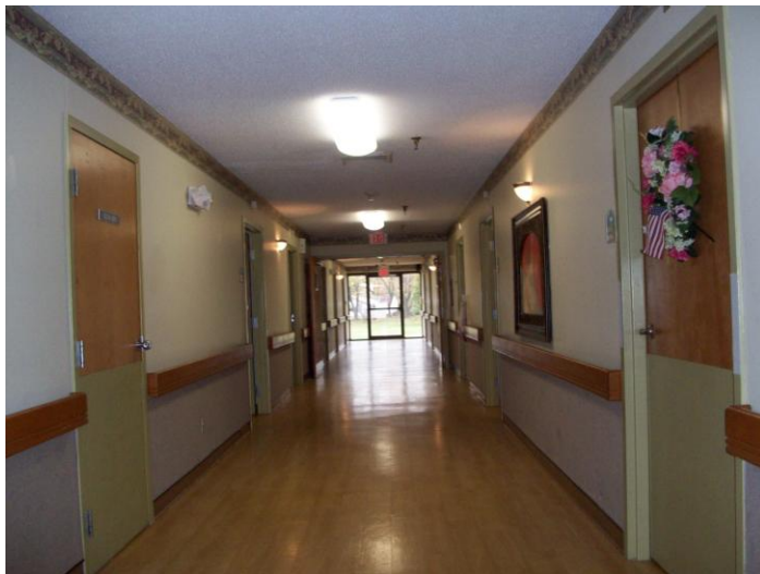
Hallway to resident rooms

They have private and semi-private rooms, as well as privacy-enhanced shared rooms. Residents are encouraged to furnish and decorate their rooms as they wish, including having their own mini-refrigerators. Residents can also have their own pets if they wish; however, there were none when I was there.