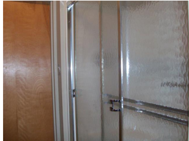
Walk-in shower in private bathroom

Future plans include redesigning the dining area and adding a fireplace and book case to the community room. They also plan on removing the nursing station, building shelves for charts, and adding a work desk. They are already working on improving meal choices.