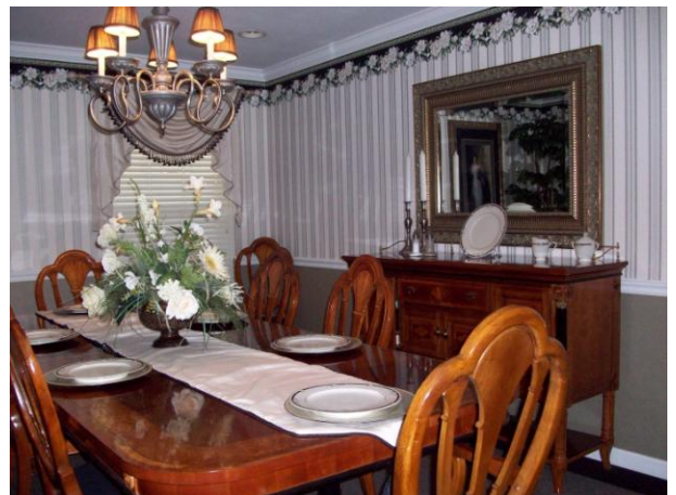
Private Dining Room

There is also a private dining room for special meals with family members.