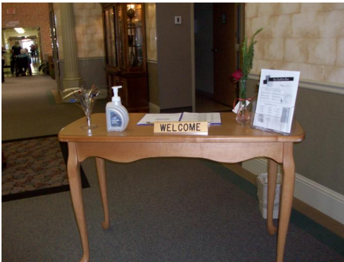
Door Greeter Table

They have a table near the main entrance for a resident volunteer who serves as their greeter. Just down the hallway there is another table where another resident displays and sells her homemade jewelry. Unfortunately, they were both away and I was not able to meet them.