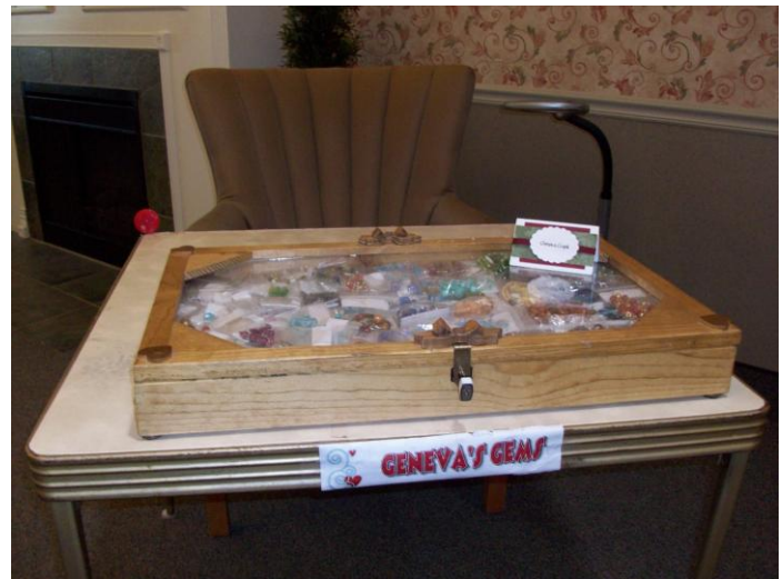
Resident's Jewelry Table